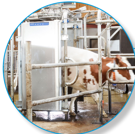
Cow identification and sorting