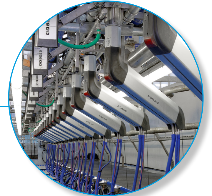
DeLaval swingarm MSA30