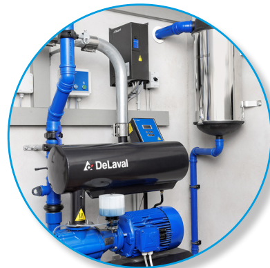
Vacuum system with DeLaval NFO