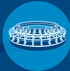
DeLaval Rotary Parlour