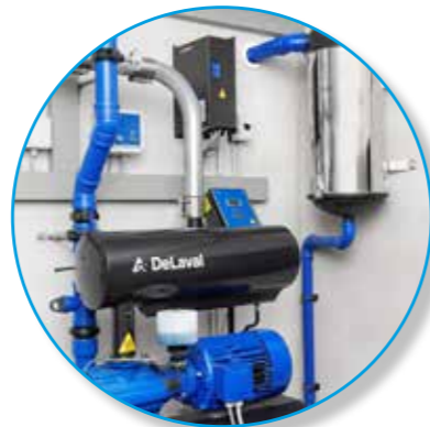
Vacuum system with DeLaval NFO