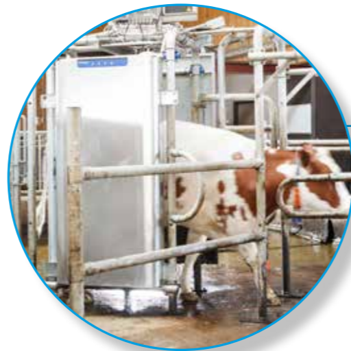
Cow identification and sorting